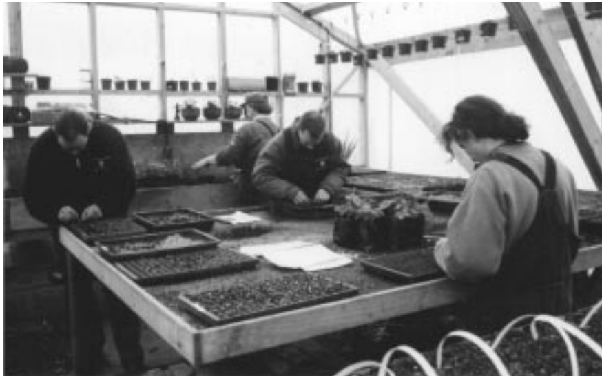
Inmates at work in a prison plant nursery