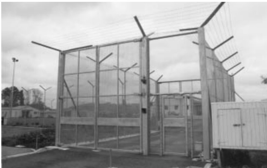
An example of modern security fencing around a corrections facility

It is our experience that prison visitors leave the immediate area soon after their visits and do not linger around the area.