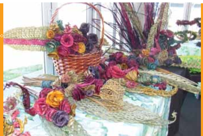
Art produced by Pacific prisoners at Spring Hill Corrections Facility.