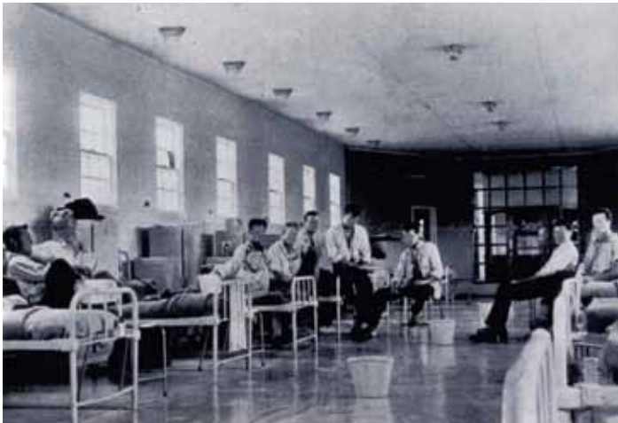
One of three inmates' dormitories from 1962. Prisoners relax after a day at work.