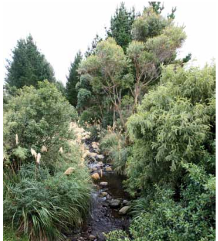
Prison-grown plants are used in riparian plantings like this one beside a Taranaki stream.

getting a job on release. In the 12 months to June 2011, 23 National Certificates in Horticulture were awarded to prisoners working in the New Plymouth and Whanganui Prison Nurseries.