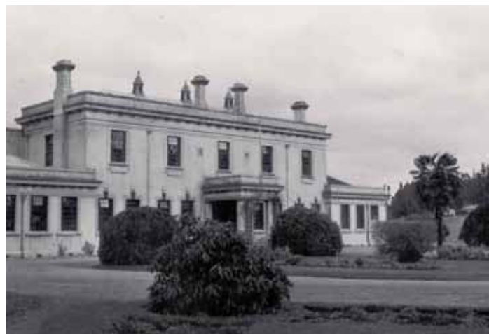
The present-day prison administration block was built in 1917 by prison labour.