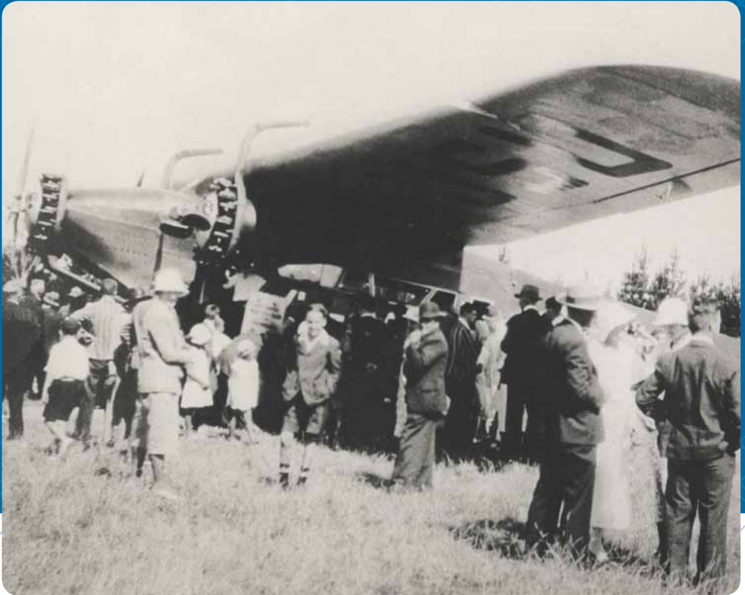
Locals still remember the day Sir Charles Kingsford Smith landed his plane in a paddock at Waikeria Prison in 1934.