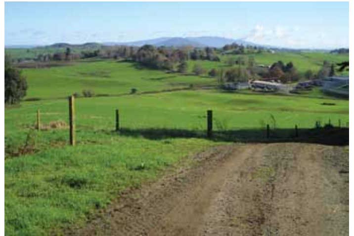
The prison farm today. Waikeria Prison dairy farm today teaches prisoners modern farming skills that will lead to qualifications.