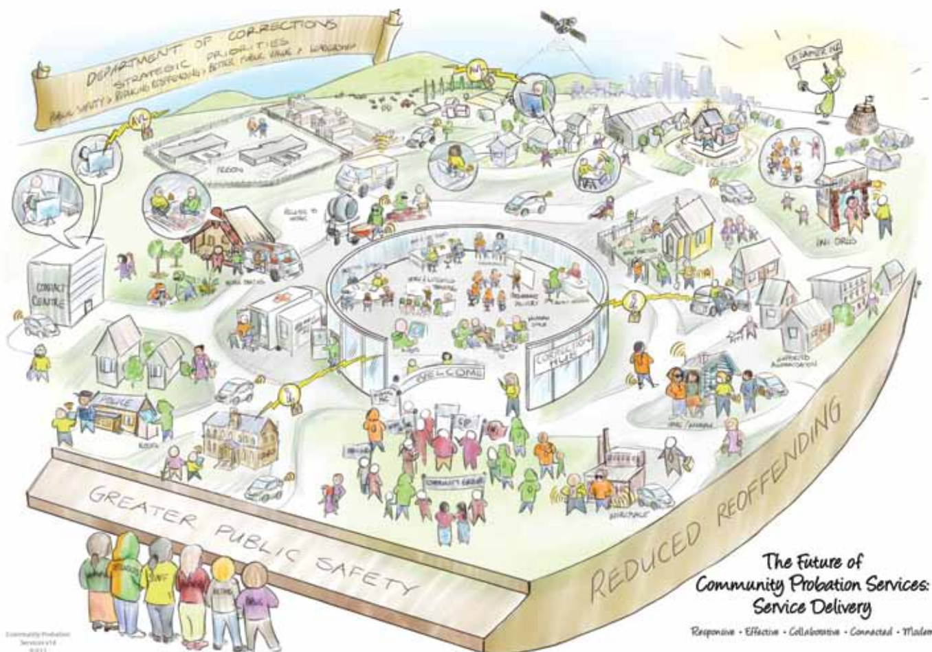
A visual representation of the Community Probation Services’ modernisation programme reflects a desire to work more closely with other organisations.

As part of the Department’s Expenditure Review, the Modernisation programme will seek efficiency gains across the organisation by ensuring staff time and resources are spent where they have the greatest effect.