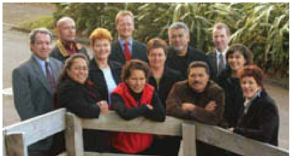
The Cultural Supervision team at a recent hui to mark the end of the pilot.

Cultural Supervision and Specialist Maori Cultural Assessment will continue to be delivered in the pilot areas. During this time processes will be consolidated and the impact on offenders will be further reviewed. cN