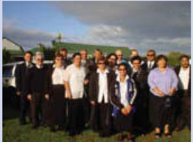
Hawke's Bay Prison staff on the last day of the marae-based noho run by Te Ara Reo o Aotearoa.

"As a result of the noho, staff are conversing more in Te Reo and using their new-found knowledge in a work setting. We also have follow-up work on-site to strengthen our learning from the noho, such as managers' meetings using karakia, writing emails in Te